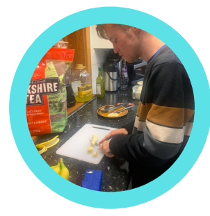
Cooking and Eating together

'I am 11 years old and I am here to tell you why youth has helped me and my friends! Youth is a place where me and other children feel welcomed it helps me feel more confident to help others and speak up for myself. We get to cook the food and then sit down and talk about our day and I like to ask everyone about their day and how they feel and talk about our problems and worries and this has inspired many children to be confident and happier to talk about problems. Children come here with big smiles on their face and I am one of them' - Homerton Grove young person comment.